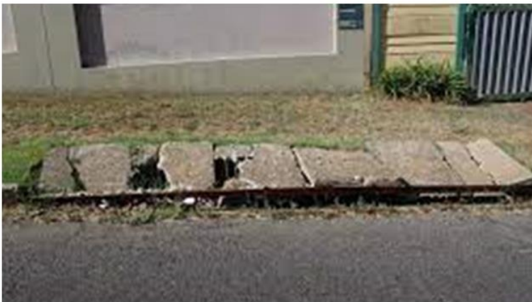
DISLODGED / BROKEN KERB INLET (KI) on Storm water drains

Crocodile cracking, also called fatigue cracking, is a common type of distress in asphalt pavement. It is often a sign of sub-base failure, poor drainage, or repeated over-loadings. It is important to prevent fatigue cracking, and repair as soon as possible, as advanced cases can be very costly to repair and can lead to formation of potholes or premature pavement failure.