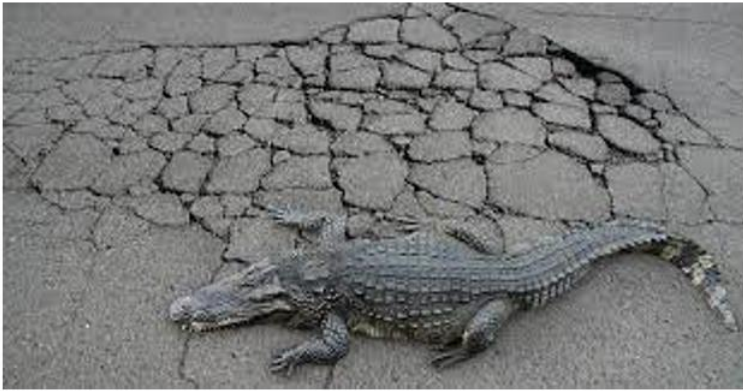
CROCODILE CRACKING OF ROAD SURFACE

Crocodile cracking, also called fatigue cracking, is a common type of distress in asphalt pavement. It is often a sign of sub-base failure, poor drainage, or repeated over-loadings. It is important to prevent fatigue cracking, and repair as soon as possible, as advanced cases can be very costly to repair and can lead to formation of potholes or premature pavement failure.